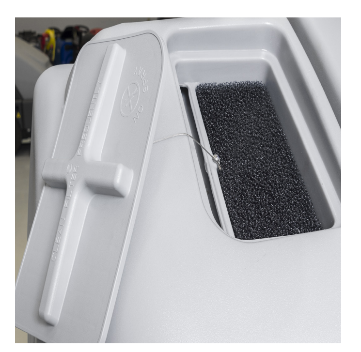
3 Check if the solution filter is cleaned.