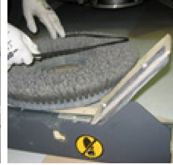
Check if there are external materials avoiding brush rotating.

Nilfisk-Advance A/S Sognevej 25 DK-2605 Brøndby Denmark