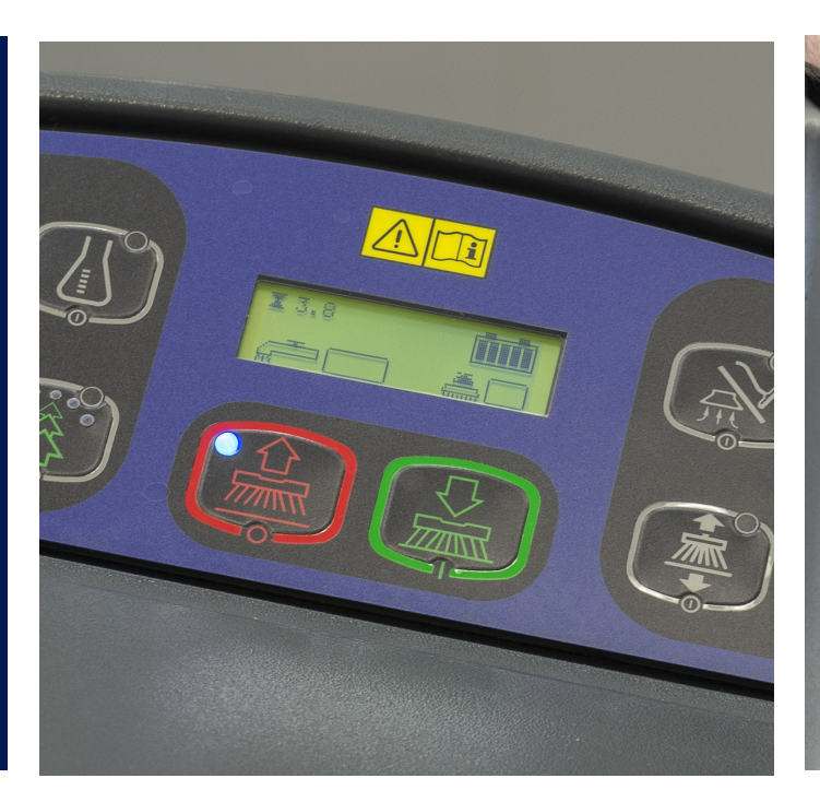
The machine doesn't work as it should?

ATTENTION! Do not use the machine before you have read and understood the User Manual