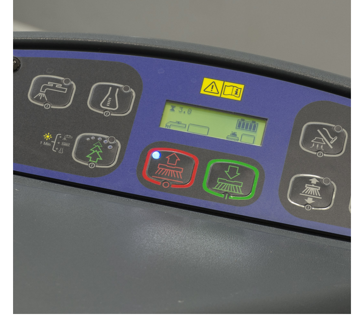
2 Check if there isn't any brush motor 3 overload i.e. 3 battery Ledsflash simultaneously.

1 Check if the brush are correctly installed and not worn out.