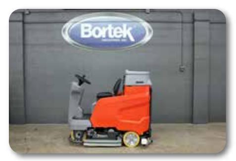
A FAMILY COMPANY SINCE 1967