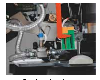
Brush and pad wear indeicator: easy to read. And the convenient discharge mechanism enables fast and easy changing of the brushes— tool free!