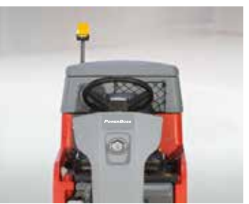
Safe Working in highlyfrequented environments: warning systems and work lights (optional).