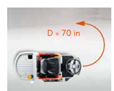
Can be used in narrow aisles and hallways thanks to its particularly compact design. 90 degree steering angle, turning circle of only 70 inches.