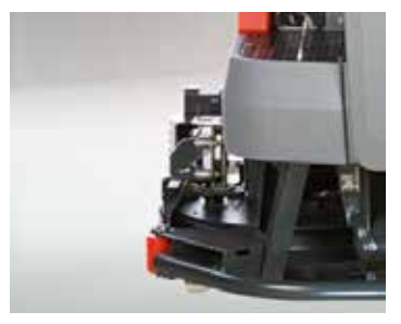
Working close to edges thanks to the brush deck protruding to the right