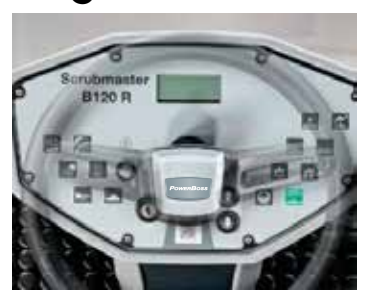
Illuminated, intuitive display: with a 1- button operating system, boost button for maximum water supply and brush pressure, and slow mode activation -- all at the push of a button.